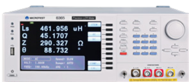
6363 / 6364 / 6365 / 6366 / 6367 / 6365A / 6365B